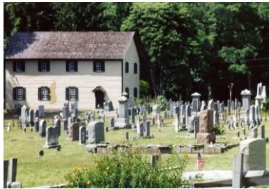
Yellow Meeting House

Organization of meeting houses followed in Piscataway - 1689 with six members, Cohansey, Salem County - 1690 with nine members and 1737 saw the formation of Yellow Meeting House - Upper Freehold near Imlaystown. Yellow Meeting House is the oldest standing Baptist meetinghouse in New Jersey. No longer in use as a meetinghouse it sits in a quiet clearing and is the burial place of Abraham Lincoln's great-grandparents.